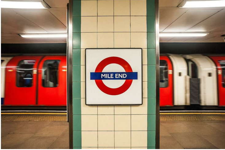
MILE END TUBE STATION