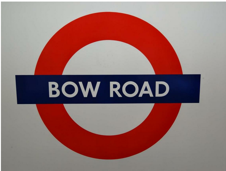
BOW ROAD TUBE STATION