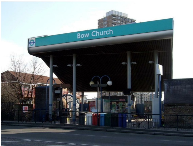
BOW CHURCH DLR